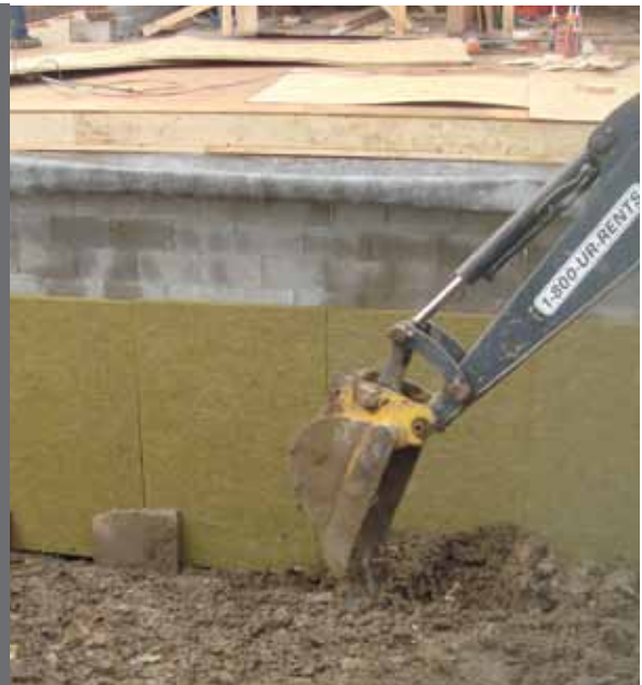
The superior strength of DrainBoard also means it is very resistant to damage during installation and backfilling operations.

For a copy of this report, please contact your local Roxul Sales or Specifications Manager, or visit roxul.com .