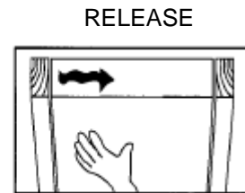
Let ComfortBatt expand to give a full fit

The friction fit created by the ComfortBatt expansion principle means the product will perform equally well in horizontal, sloped dormer, vertical or overhead situations. The product is notable for its “stay put” ability when installed. ComfortBatt is easier and faster to install than traditional insulation products and achieves full R-value.