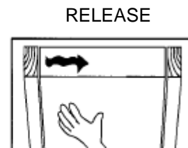
Let ComfortBatt expand to give a full fit

The friction fit created by the ComfortBatt expansion principle means the product will perform equally well in horizontal, sloped dormer, vertical or overhead situations. The product is notable for its “stay put” ability when installed. ComfortBatt is easier and faster to install than traditional insulation products and achieves full R-value.